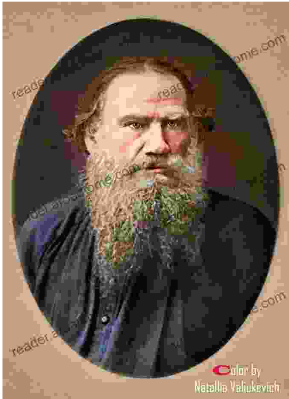
Leo Tolstoy: Chronicler of Rural Life