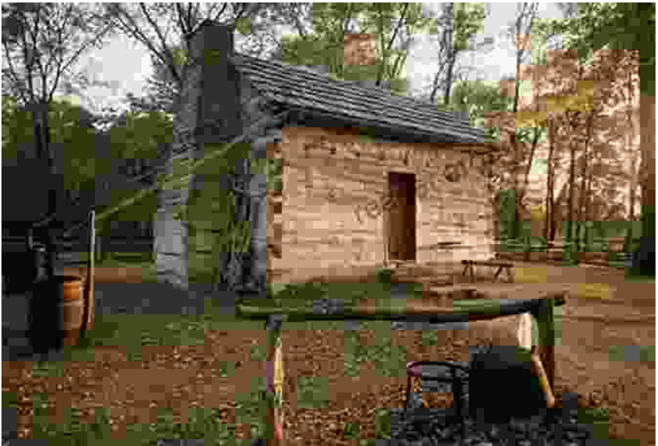
The Tree That Abe Lincoln Knew as a Boy