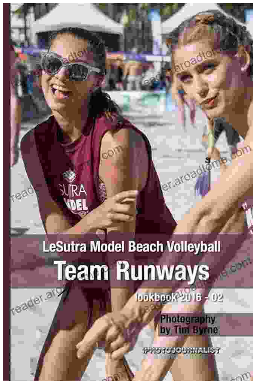
Lesutra Model Beach Volleyball Team 2bc Wave Rider One-Piece

The "Sunbeam" skirted bikini boasts a playful and feminine silhouette, perfect for those who love to add a touch of flair to their beach look.