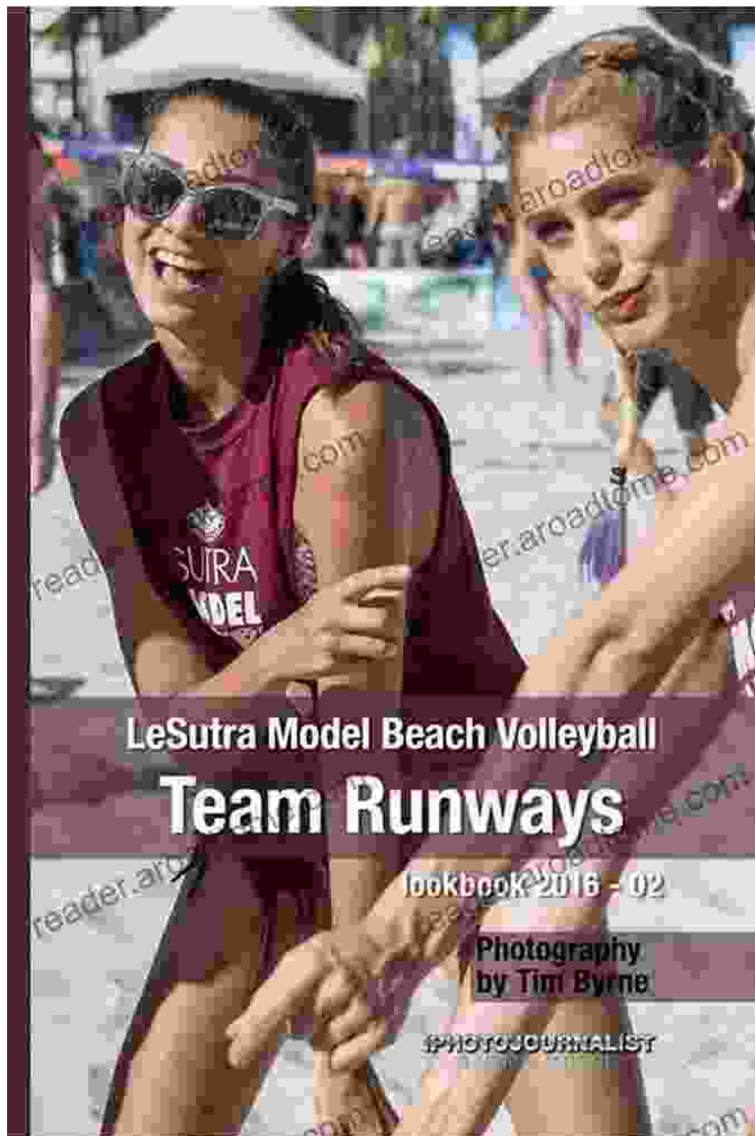
Lesutra Model Beach Volleyball Team 2bc Tidal Wave Sunglasses

No beach volleyball look is complete without the perfect accessories. The Lesutra Model Beach Volleyball Team 2bc Lookbook 2024 includes a range of stylish accessories to complement your swimwear. From the sleek and sporty "Tidal Wave" sunglasses to the oversized "Seashore" beach bag, each piece adds a touch of sophistication and functionality to your beach day attire.