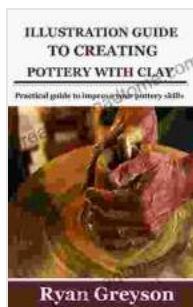
ILLUSTRATION GUIDE TO CREATING POTTERY WITH CLAY: Practical guide to improve your pottery skills

If you're interested in learning how to create beautiful pottery, then this is the book for you. This comprehensive guide will teach you everything you need to know, from choosing the right clay to glazing and firing your pieces.