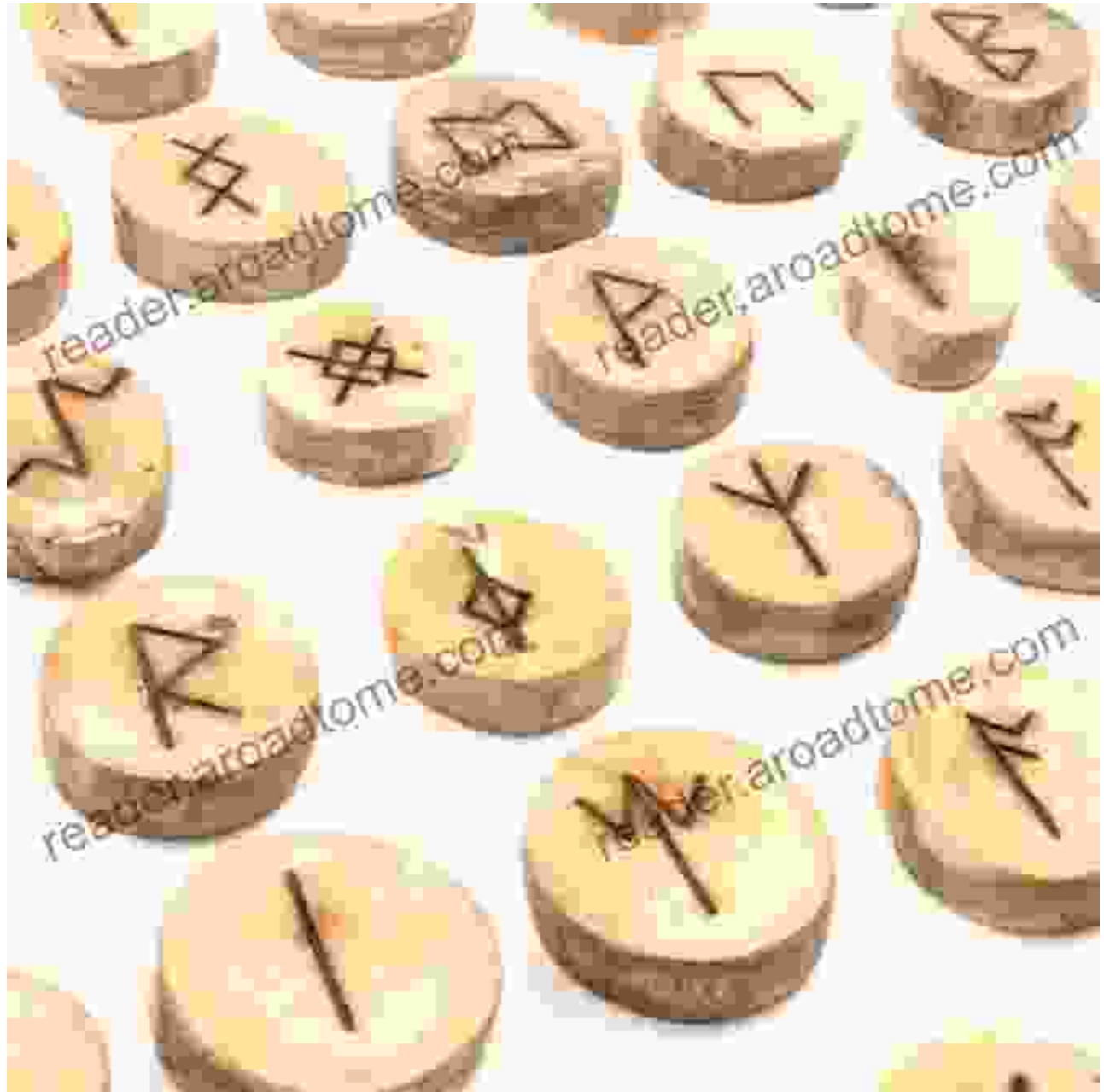
Anglo-Saxon Rune Stone

The Anglo-Saxon calendar is inextricably linked to the ancient practice of rune divination. Each month of the year is associated with a specific rune, a symbol that carries deep spiritual and practical significance.